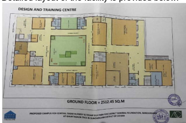
Fig 1. Layout of Ground Floor

Detailed layout of the facility is provided below: